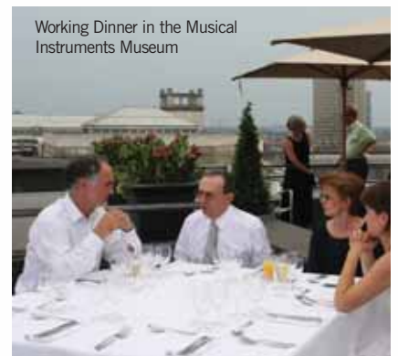
Working Dinner in the Musical Instruments Museum

On Tuesday evening, the working dinner was organised at the Museum of Musical Instruments in the heart of Brussels. The roof terrace provided the perfect note of harmony to the entire event. While enjoying the good food and views of Brussels the CONCERTO partners continued working by exchanging their views on the initiative. Yet it also allowed all to relax and enjoy some personal moments at the end of two hard days of work.