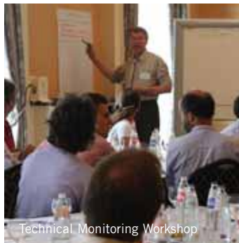
Technical Monitoring Workshop