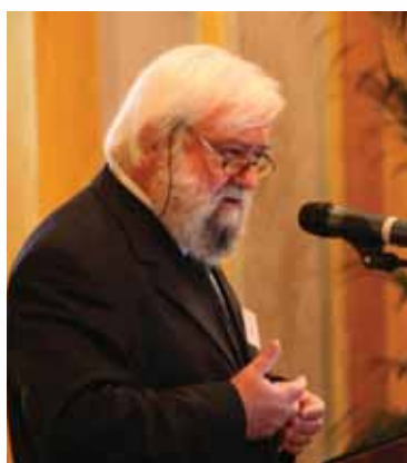
Gonzalo Molina Igartua, Directorate General Transport and Energy (DG TREN) European Commission